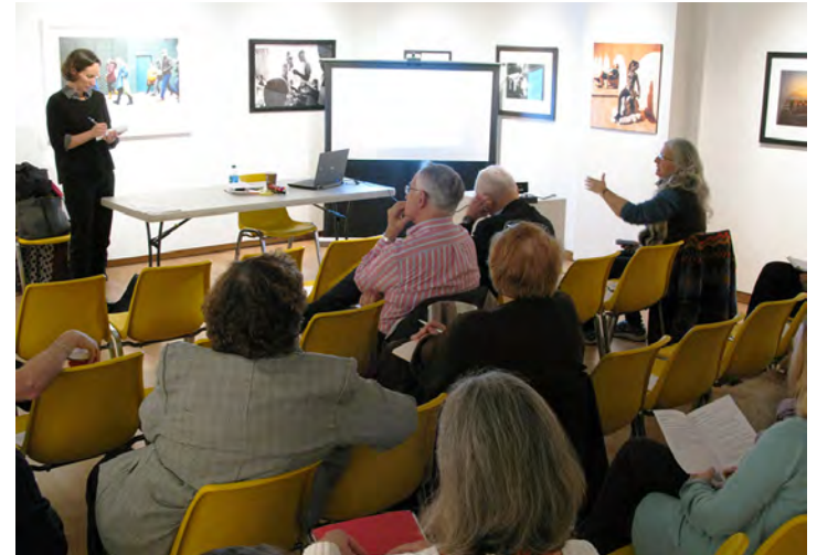
Artist Roundtable, Torpedo Factory, November 22, 2013.

The plan starts with a vision statement – a concise explanation of how public art should impact people's experience of the city. The vision statement provides a general context for decisions about