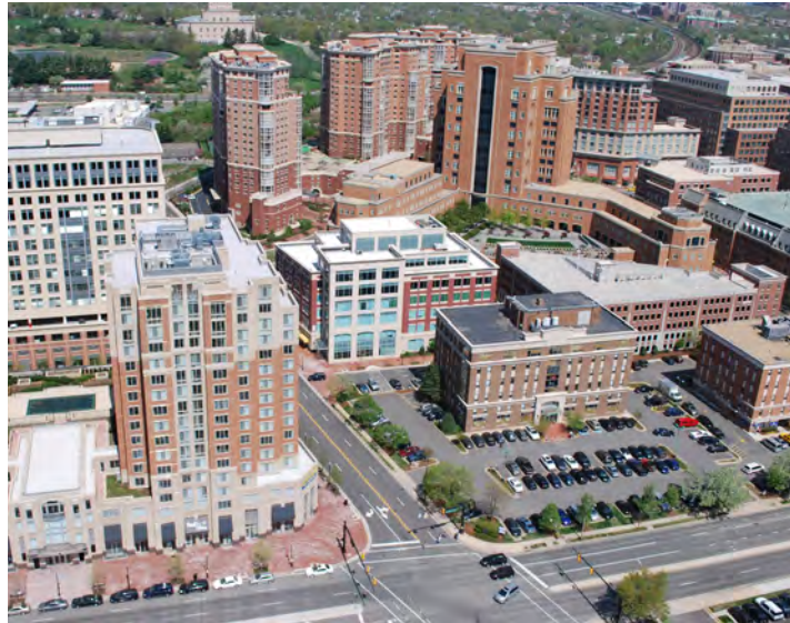
The Carlyle District, Alexandria, Virginia.

As these areas of the city redevelop, the Office of the Arts should monitor City capital projects and private development projects to determine if any of them could be linked to public art projects that could help achieve a goal or implement recommendations of the