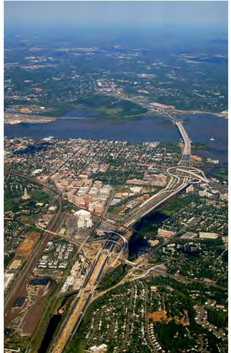
Alexandria, Virginia.

establishing a distinctive identity for Alexandria's evolving communities, enhancing parks, gathering places and neighborhood focal points, and enhancing new infrastructure and community facilities.